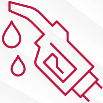
DIESEL EURO 6