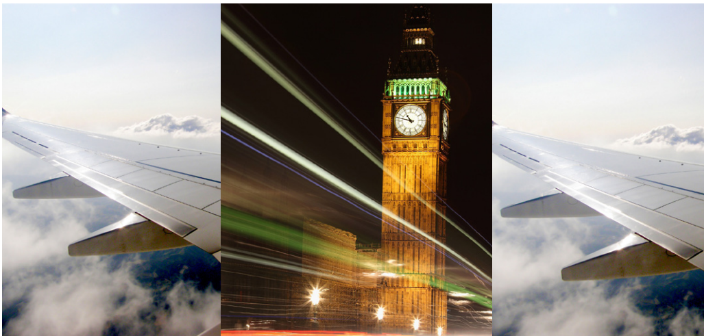
Fig.1 Display showing static image on the left and right of the display and a centrally positioned area available for moving image/video content.