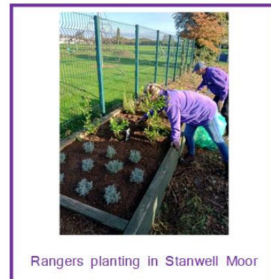
Rangers planting in Stanwell Moor

In December the Heathrow Community Rangers lent a hand at the five primary schools we work with and decorated Christmas trees for their playgrounds. This month, as we entered another lockdown, the Rangers delivered 700 workbooks to the homes of children who attend William Byrd Primary Academy, helping their pupils to continue learning at home. The Heathrow Rangers have been busy helping to make a difference to the Waye Avenue Allotments in Cranford by building planters, delivering soil, and undertaking maintenance work as well as gardening at St Thomas Church Colnbrook, cutting back overgrown hedges and brambles.