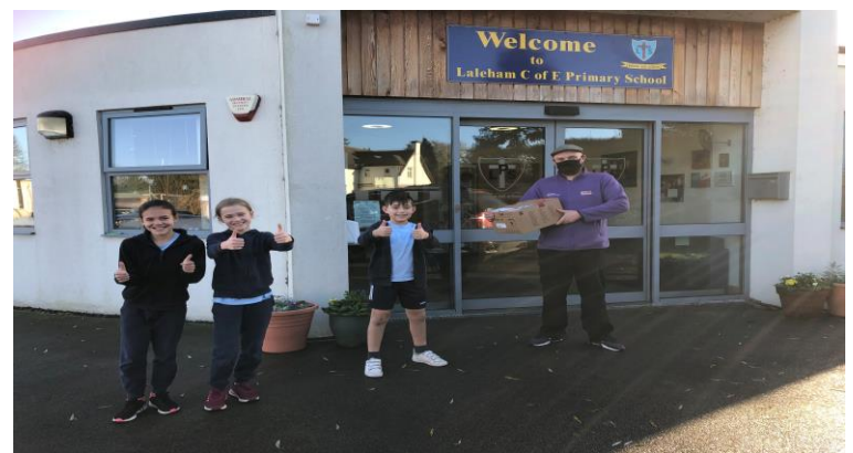
Laleham C of E School receiving their defibrillator

Further details and the current status of each of our noise insulation schemes are provided on the Heathrow website .