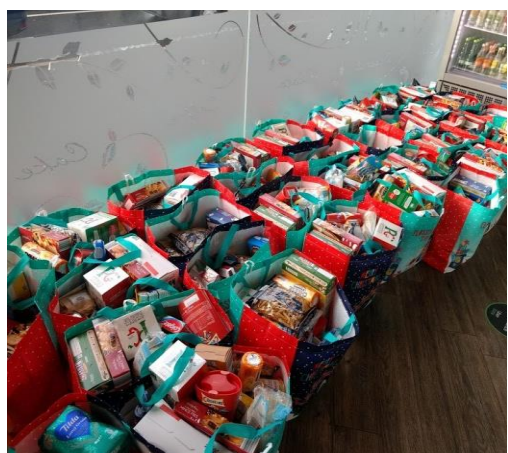
HWBL Christmas Hampers

Heathrow has also been supporting local foodbanks, with our Rangers providing assistance with deliveries and helping with donations.