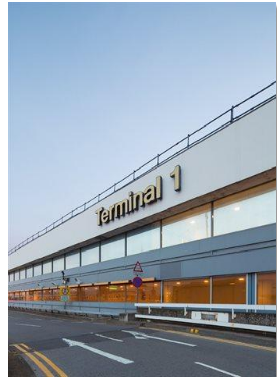
Terminal 1 closure brought forward to June 2015

Finally, following discussions with trade union and other member representatives, a proposal has been developed to make the defined benefit pension scheme affordable and sustainable in the near future. The proposal has been subject to a formal consultation with individual members which will close on 17 July 2015. If the proposals are to be implemented, the changes to the Scheme will be made effective from 1 September 2015.