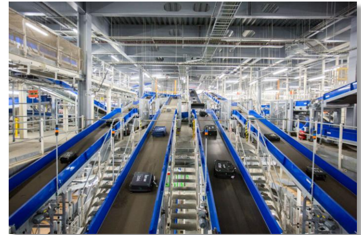
Terminal 3 Integrated Baggage facility

In line with the regulatory settlement, the capital programme may increase to up to £3.3 billion. This is subject to further scoping of the remaining individual projects and corresponding approval of the business cases.