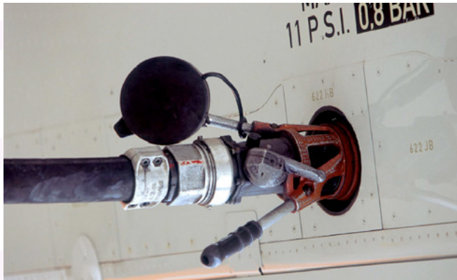
Exporting Excellence: Spotlight on Yorkshire and the Humber

Businesses in Yorkshire and the Humber are working hard to reduce their carbon footprint. At Heathrow's Exporting Excellence roundtables, the businesses we spoke to explicitly called for government to support SMEs to export sustainably, whilst minimising extra burdens and costs.