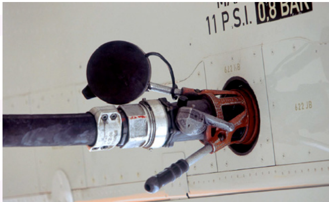
Exporting Excellence: Spotlight on the West Midlands

Businesses in the West Midlands are working hard to reduce their carbon footprint. At Heathrow's Exporting Excellence roundtables, the businesses we spoke to explicitly called for government to support SMEs to export sustainably, whilst minimising extra burdens and costs.